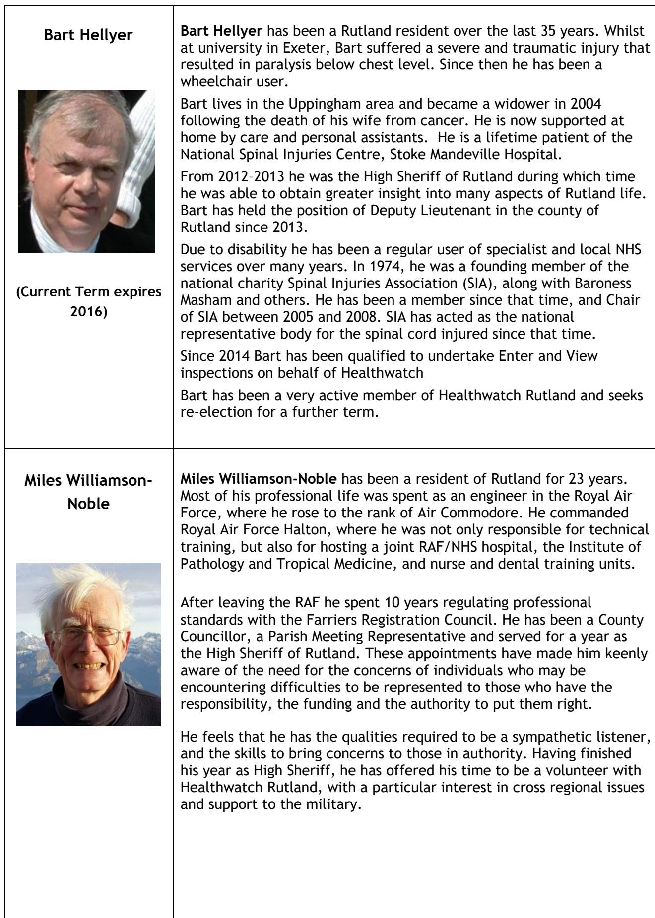
TABLE A: Five Proposed Board Members