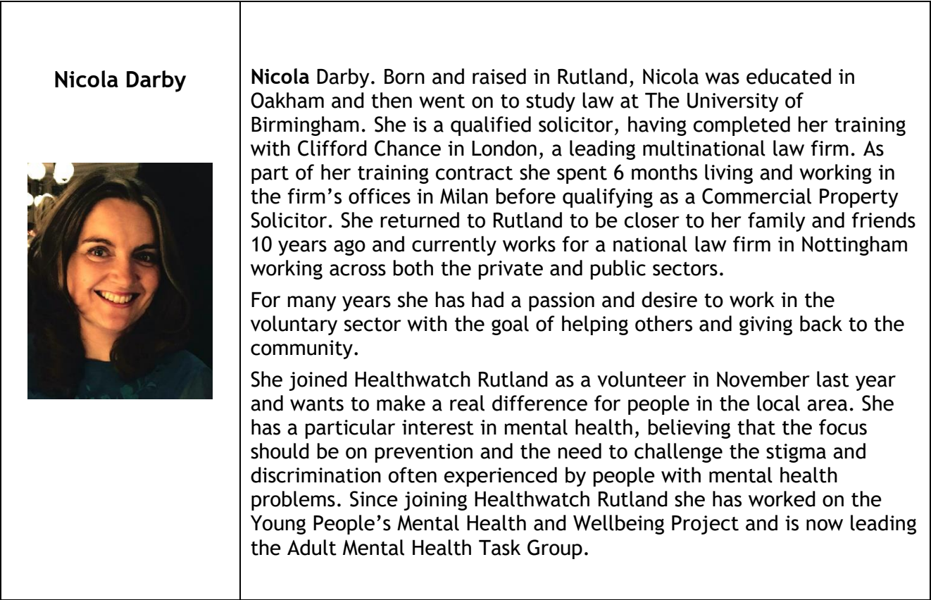
TABLE B: Current Board - Five Members not due for re-election